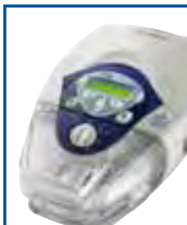
VPAP™ Adapt SV