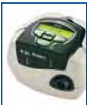
VPAP™ IV VPAP™ IV ST