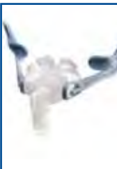
Swift™ LT for Her