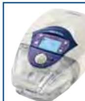
VPAP™ III ST-A with QuickNav