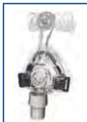
Mirage Activa™ LT