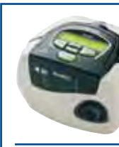
S8 Lightweight™ II Platinum Series with Easy-Breathe