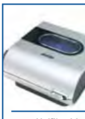
H5i™ with ClimateLine