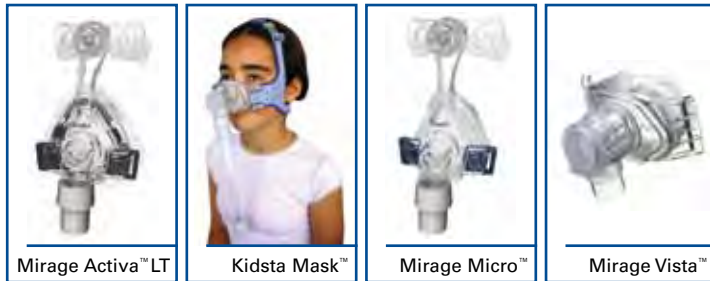
Mirage Activa™ LT