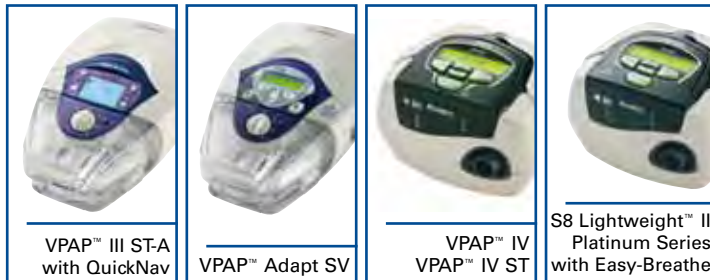
VPAP™ III ST-A with QuickNav